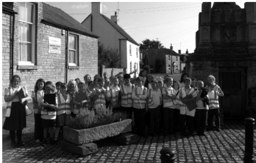
Children from Year 4 Linchfield School visit the ancient Cross as part of their History of the Deepings project