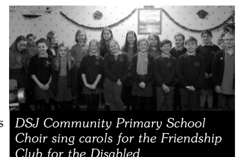
DSJ Community Primary School Choir sing carols for the Friendship Club for the Disabled.