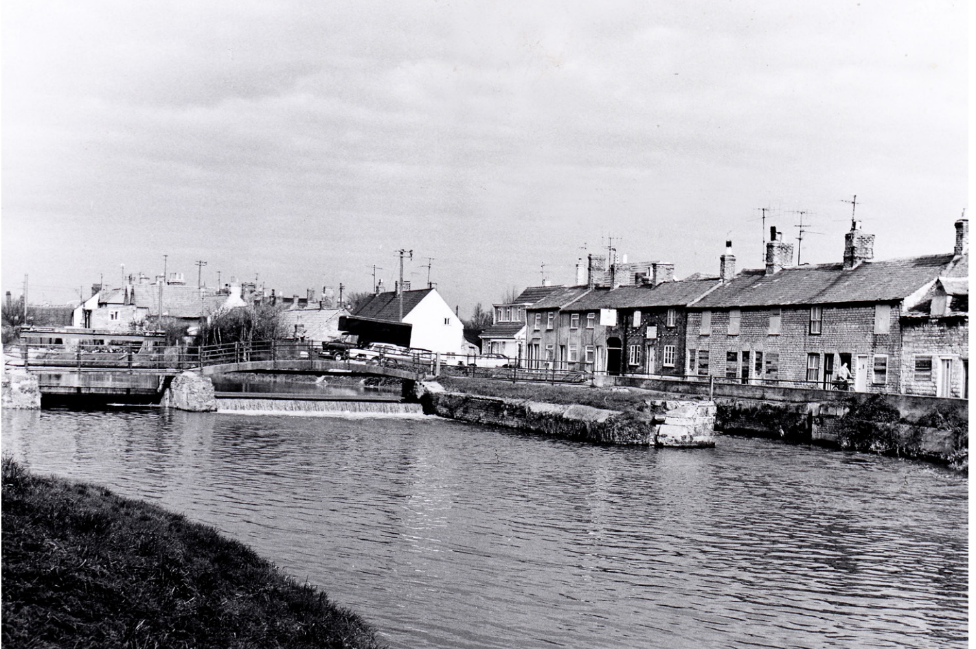
High Locks Deeping St James 1975

parishes.lincolnshire.gov.uk/DeepingStJames/