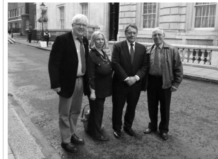
Campaigners took the fight to save the 'St James Deeping' signal box to the heart of government.

In a last-ditch effort to stop Network Rail demolishing the much-loved Victorian box, three members of your parish council met with senior Network Rail officials at a meeting hosted by local MP John Hayes in his Downing Street office.